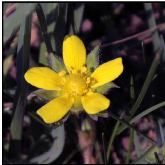
Potentilla reptans Creeping Cinquefoil

Source: The Manassas Journal – Notes From Brentsville – February 16, 1912